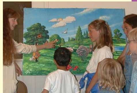
Animated felts illustrate the Bible lesson