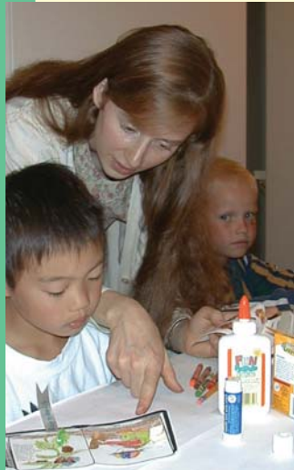
Crafts reinforce the lesson

Drawn by the shepherd's love, the lambs find comfort in his arms and drink in the pure milk with delight.