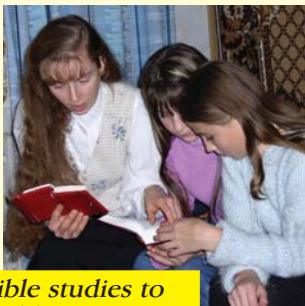
Giving Bible studies to children