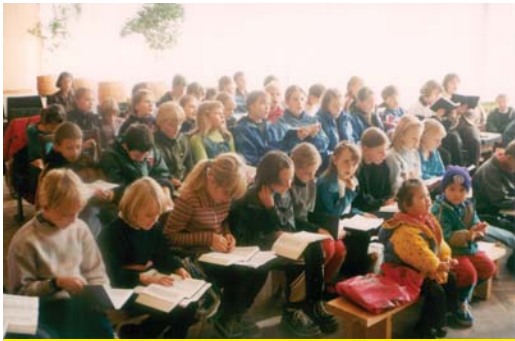
Children in Ukraine find beauty in the Bible

Jesus knew that "children would listen to Him and accept Him as their Redeemer far more readily than would grown-up people." Desire of Ages, 5B.